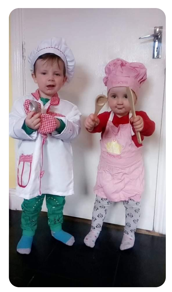
Overall, in the Ballyhoura Development area, a total of 647 families were supported either directly or indirectly.